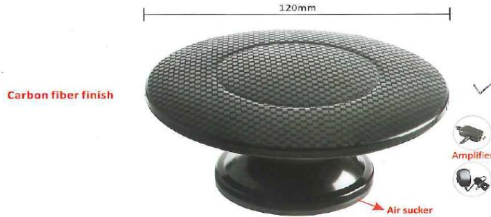
Model No.: DVB-T9009B 120x120x50mm